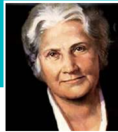
Dr. Maria Montessori